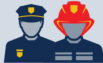
Stronger Public Safety

If approved by voters, the sales tax extension will continue supporting critical personnel, streets and infrastructure, and public safety capital investments. Extending this sales tax provides a way to sustain Glenpool's forward progress.