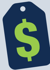
Full Service City