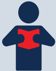
Residential and School Growth